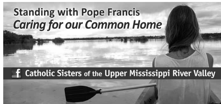
This design of more than 20 billboards promoted by Catholic Sisters of the Upper Mississippi River Valley was placed throughout Iowa during the February caucuses.

The billboards were placed in the Iowa cities of Bettendorf, Cedar Rapids, Clinton, Davenport, Des Moines and West Des Moines,