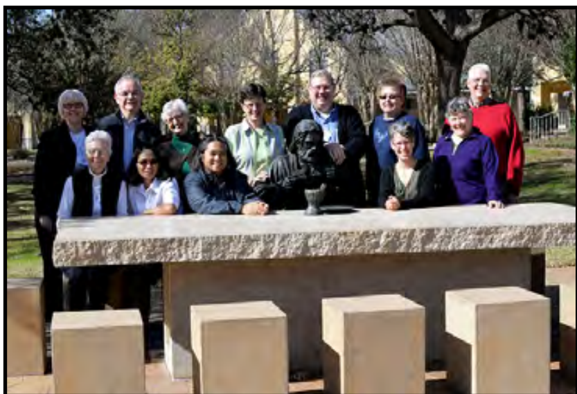
ForMission Class of 2018 and Team gathered at the Last Supper picnic table.