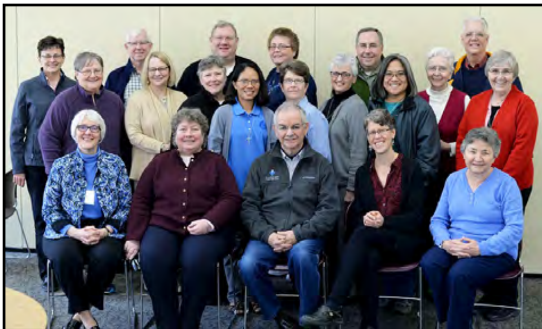
RFC ForMission Team and Classes of 2018 and 2019