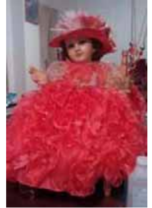
Dressing baby Jesus at the lifting up ceremony

As I reflect on this HOME project over these first 6 months, I am able to see the inroads that God has enabled me to have with the people. In this ministry it is a true "walking with" the people. For instance, during December and February, I was able to accompany the Hispanics in Cascade and Dyersville for their cultural tradition of laying down baby Jesus, and then in February, lifting up and dressing of the baby Jesus. Even though I was 25 years in Florida, and invited various times, I could never go to these celebrations because of liturgical commitments or religious education. While on-lookers may wonder at this tradition, which takes over an hour, with rosary, prayers, venerating the baby Jesus, etc. to me, it is a strong symbol of their faith, which has carried them through many difficult times. This is a family time, and there were at least 40 people gathered in the small apartments, and almost 100 people came together in the individual homes.