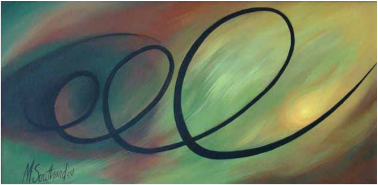
"Evolutionary Spiral" Artist: Mary Southard, CSJ www.MarySouthardArt.Org Courtesy of www.MinistryOfTheArts.Org Congregation of St. Joseph