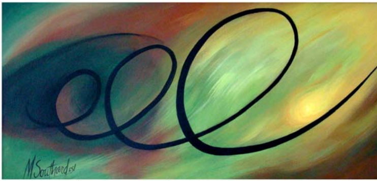
"Evolutionary Spiral" | Artist: Mary Southard, CSJ | www.MarySouthardArt.Org Courtesy of www.MinistryOfTheArts.Org | Congregation of St. Joseph